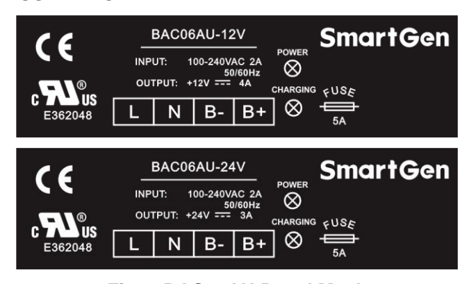
Fig. 2 BAC06AU Panel Mask