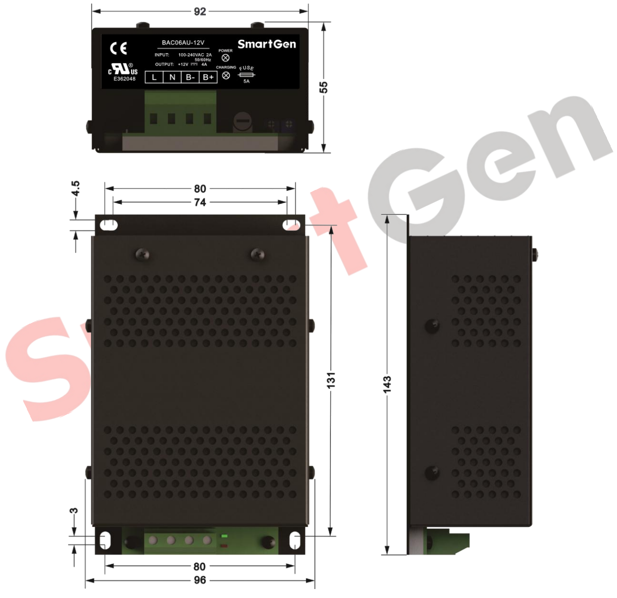
Fig. 3 BAC06AU Installation Size (Unit:mm)